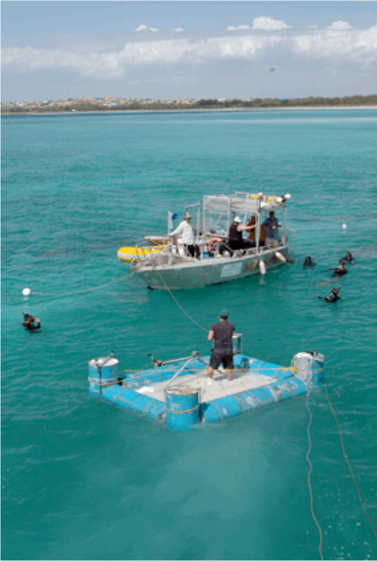
Fig 4. Manoeuvring the loaded sand barge into position

The hammering of the ring to release the door and its re-locking was performed by a snorkeler using the procedure described in the Construction and Operation section of this paper (Fig. 5).