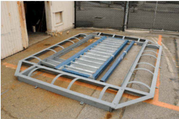
Fig 3. The main frames and door in position in preparation

drum resting on a flat bar welded to form a triangle at each of the four corners. Each corner drum was secured by threaded rods (15 mm diameter) bolted through the extended frame and through a steel cross-strap positioned on top of each drum. All other nuts/bolts used to assemble the barge were 10mm in diameter. At this stage the four main drum frames (sides and ends, with drums temporarily removed) were bolted to a welded rectangular-shaped central frame (1800 mm x 2760 mm), made from angle-iron (100 mm x 100 mm) that was to become the frame work for the barge floor incorporating the door. The floor/door frame and frame of the actual door (800 mm x 2750 mm) were made from welded square section steel tube (75 mm x 75 mm). The open ends of the tube were fitted with cover plates and welded to be air-tight. To provide a strong floor and improve overall rigidity of the construction, steel 'C' section purlins (galvanized) were used (200 mm x 75 mm x 2 mm). The purlins were cut into short lengths and the ends welded to each side of the frames and to each other. This further improved floor strength and the overall rigidity of the barge (Fig. 3).