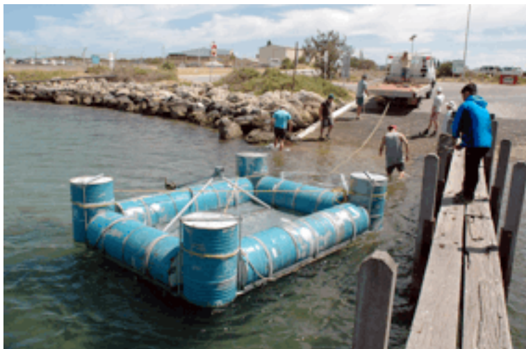
Fig 1. The completed sand barge when first launched

Commercial dredging and pumping of sand was also considered but financial constraints ultimately ruled out any of these options. The volume of sand required to fill the enclosed area to the recommended height of 0.8m was calculated to be 165 cubic metres. To improve the rate at which a reasonable amount of sand could be added to the enclosure a small budget ($2000 AUD) was provided by the Australian Historic Shipwreck Protection Project (AHSP) for the Western Australian Museum's team of retired, volunteer Marine Engineers to design and construct a 3 x 4m sand dumping barge (overall dimensions actually 3050 mm x 3900 mm). Costs incurred were mainly for the steel framework and floor components of the barge as they required materials of specific dimensions. A small boat winch and pulley were also specific purchases. Fourteen steel drums (each 200 litre capacity) were used in the construction, all of which were obtained gratis. Four drums were positioned vertically essentially halving the depth to which they would submerge and therefore halving their effective floatation capacity resulting in an overall buoyancy equivalent to twelve drums. Note no labour costs were incurred in the construction of the barge (Fig. 1).