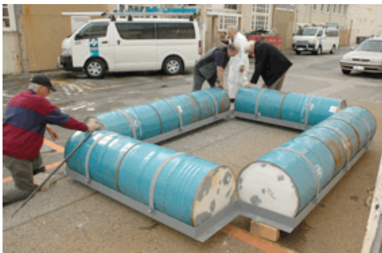
Fig 2. The four outer-frames with strapped drums installed

museum's team of volunteer Marine Engineers had the necessary skills and tools to construct the barge and would provide a free design process and labour. Construction was to be carried out using welded and bolted mild steel. Due to time constraints during its manufacture the non-galvanized metal parts of the barge were only painted with a corrosion inhibiting zinc undercoat. The engineers advised against direct end to end welding of the drums in favour of constructing a framework into which individual drums could be placed and replaced if no longer airtight. The dual doors were omitted in favour of a single central door. This was done to simplify its construction and operation but importantly to avoid the possibility of one door not operating in unison with the other and potentially resulting in the barge tipping over from the weight of the sand remaining on one side. The project began with the welded assembly of four individual outer frames made from angle iron (100 mm x 100 mm) designed to hold two horizontal drums on each of the fore and aft frames (1940 mm x 540 mm) and three horizontal drums on each side frame (3850 mm x 540 mm). Flat steel retaining straps (50 mm x 3 mm) were rolled to conform to the curvature of the drums and welded in place to fit across each frame. A detachable set of the curved straps, each with a screw threaded rod welded on the ends, were made to mate with corresponding holes to bolt the drums to the frame (Fig. 2).