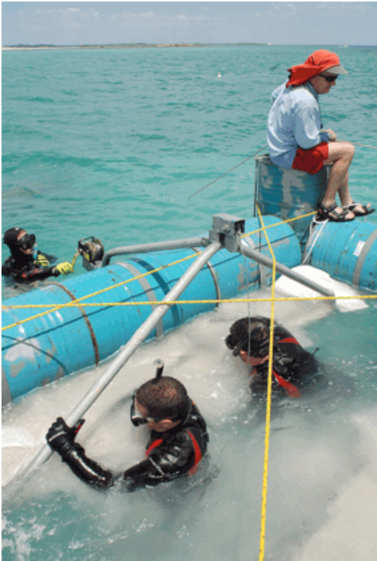
Fig 6. Snorkelers removing sand not directly released when the door opened

At the end of the day the barge was left moored over the James Matthews site, two solar cell charged lamps were attached as riding lights to warn fishers in small boats should they be travelling in the vicinity of the wreck at night.